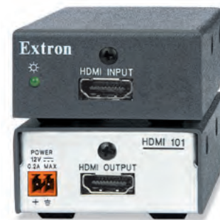
HDMI 101 - HDMI Cable Equalizer

For details on any of the best practices mentioned in this article, or for questions on how to maintain signal integrity within your specific system design, please contact an Extron Customer Support Representative.