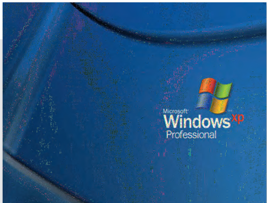
Digital images should reflect pristine, bit-for-bit representations of source material. Sparkling, as seen in this screen capture, is a certain sign of bit error and indicates that the image may soon fail entirely.

Bit errors typically appear as video "noise" and escalate rapidly toward transmission failure. If you're seeing symptoms such as distortion, missing lines in the frame or line header, or sparkles or streaking within the video, then your signal is at the verge of collapse. Jitter is another sign of bit loss, and is characterized on your display as data edges appearing to dance back and forth randomly.