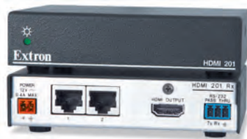
HDMI 201 - Twisted Pair Extender pair